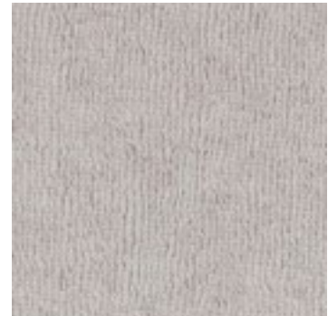
02551.003 LIGHT GREY