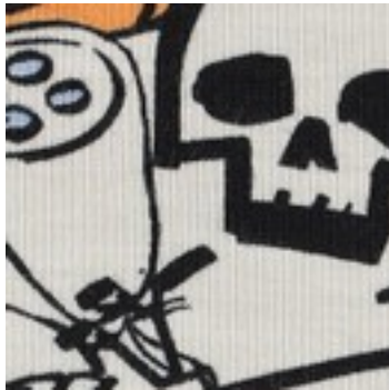
03102.001 LIGHT GREY