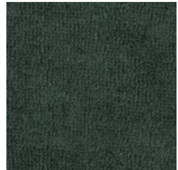
02551.027 DARK GREEN