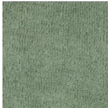
02551.025 OLD GREEN