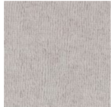
02551.003 LIGHT GREY