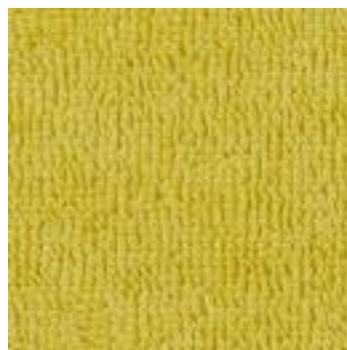
02551.016 LIGHT YELLOW