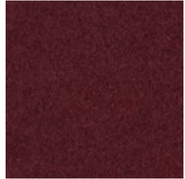
03783.045 WINE RED