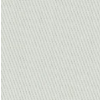
01786.020 LIGHT GREY