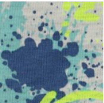
03077.002 ECRU MELANGE