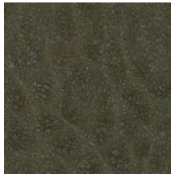
03321.003 ARMY GREEN