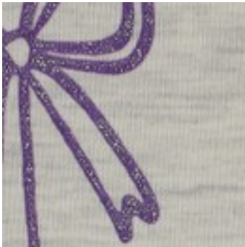
04121.001 ECRU MELANGE