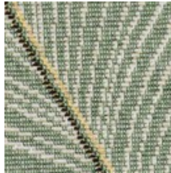
03334.003 SAGE GREEN