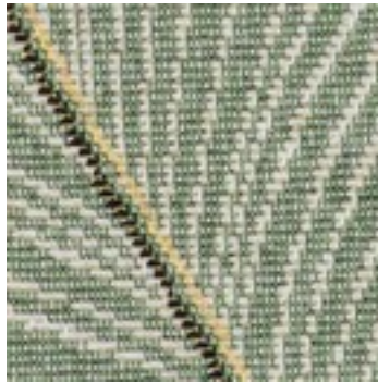
03334.003 SAGE GREEN