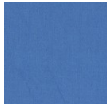
03495.015 ROYAL BLUE