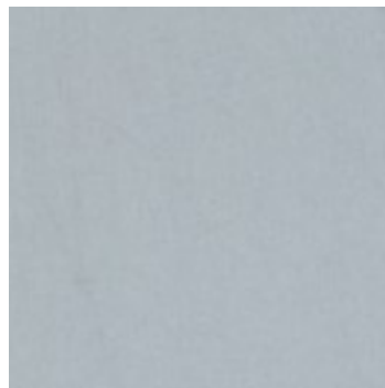
03495.014 PALE TURQOISE