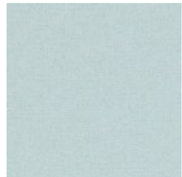
05124.012 LIGHT BLUE