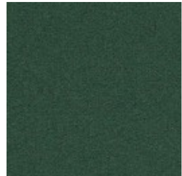
05124.025 DARK GREEN