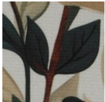
04178.001 OFF WHITE