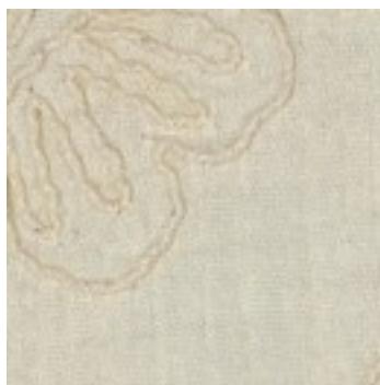
03649.062 NATURAL WASHED