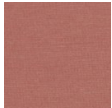
03800.024 OLD ROSE