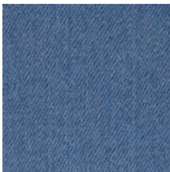
01050.005 INDIGO BLEACHED