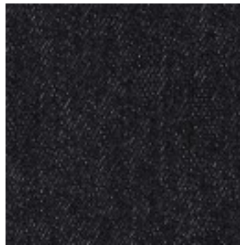
01050.003 BLACK BLUE WASHED