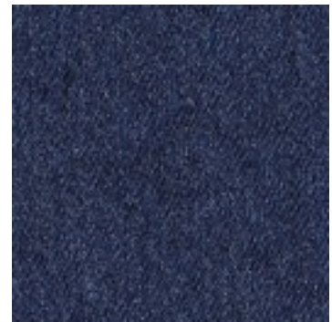
01050.004 INDIGO WASHED