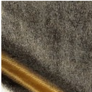
05190.001 LIGHT GOLD