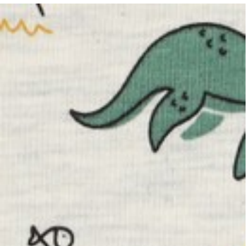
04133.001 ECRU MELANGE