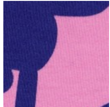
04059.003 LIGHT MAGENTA