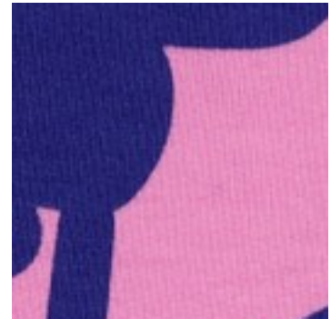
04059.003 LIGHT MAGENTA