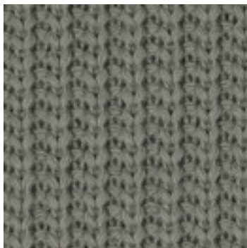
03331.004 OLD GREEN