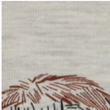
03114.001 ECRU MELANGE