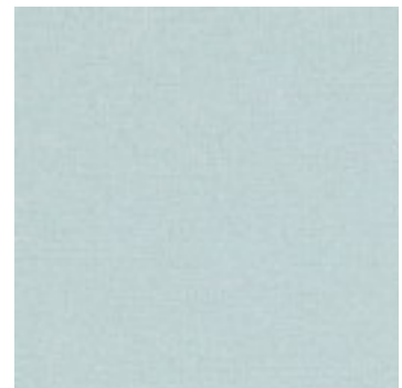
05124.012 LIGHT BLUE