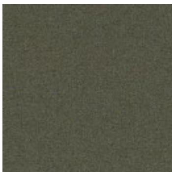
05124.029 ARMY GREEN