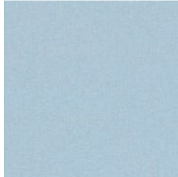
05124.033 BABY BLUE