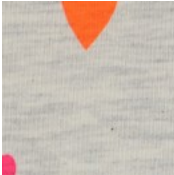
04118.001 ECRU MELANGE