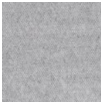
03783.038 LIGHT GREY MELANGE