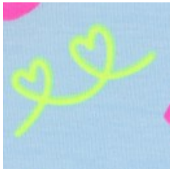
04117.002 LIGHT BLUE