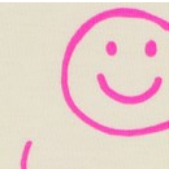
04117.001 OFF WHITE