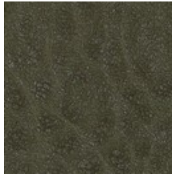
03321.003 ARMY GREEN