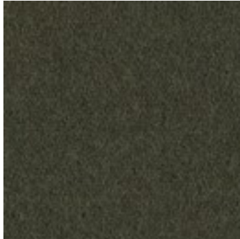
03783.026 DARK GREEN