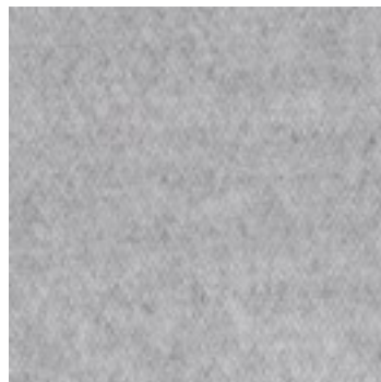
03783.038 LIGHT GREY MELANGE