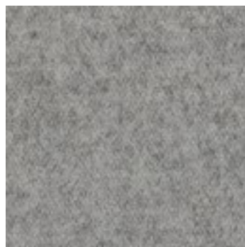
03783.016 GREY MELANGE