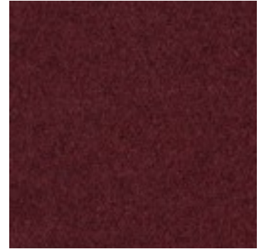
03783.045 WINE RED