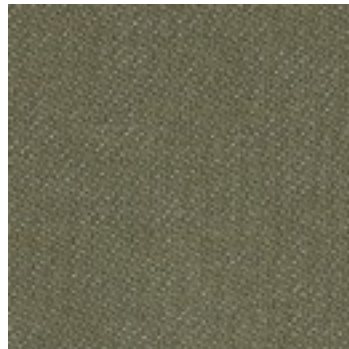
02530.023 ARMY GREEN