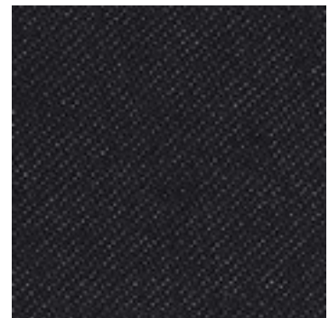
02530.011 DARK BLUE