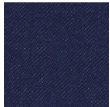
02530.027 DARK COBALT