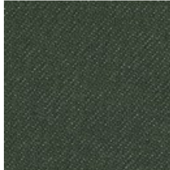
02530.018 DARK GREEN