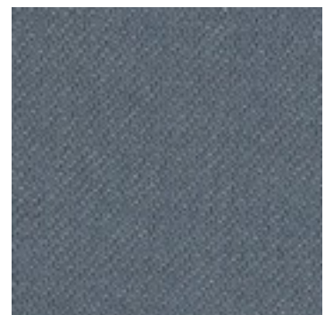
02530.016 BLUE GREY