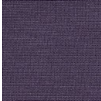
03800.030 DARK PURPLE