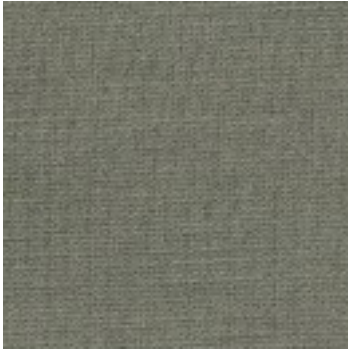
03800.029 ARMY GREEN