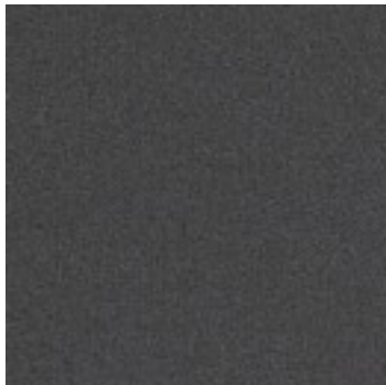
05124.021 DARK GREY