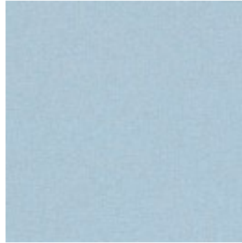
05124.033 BABY BLUE