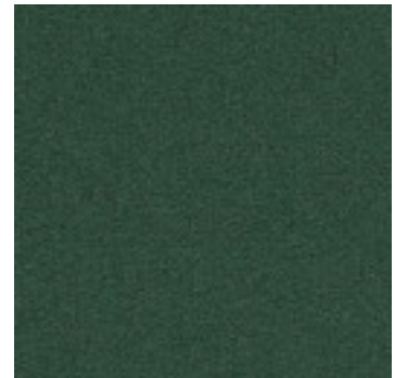
05124.025 DARK GREEN