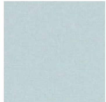
05124.012 LIGHT BLUE