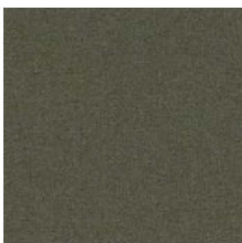
05124.029 ARMY GREEN