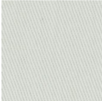
01786.020 LIGHT GREY