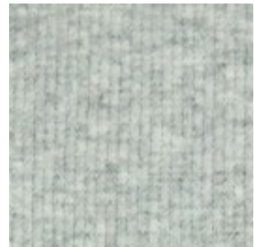
08769.004 LIGHT GREY MELANGE