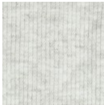
08769.008 BEIGE MELANGE