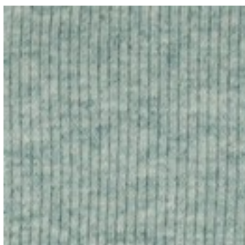
08769.092 GREEN MELANGE