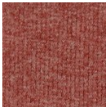
08769.094 HENNA MELANGE