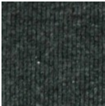
08769.002 ANTHRA MELANGE