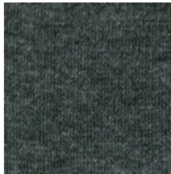
08769.003 GREY MELANGE