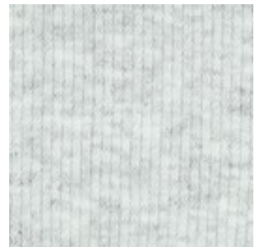
08769.014 ECRU MELANGE