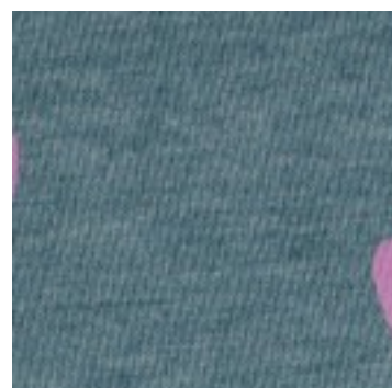
04118.032 SMOKE BLUE MELANGE