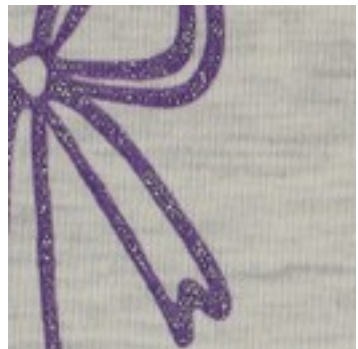
04121.001 ECRU MELANGE