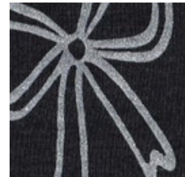
04121.005 INDIGO MELANGE