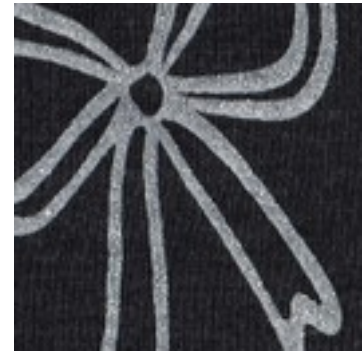
04121.005 INDIGO MELANGE