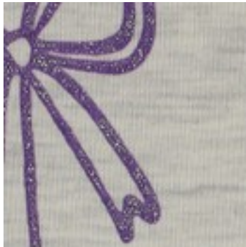
04121.001 ECRU MELANGE