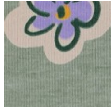
04134.017 DARK MINT MELANGE